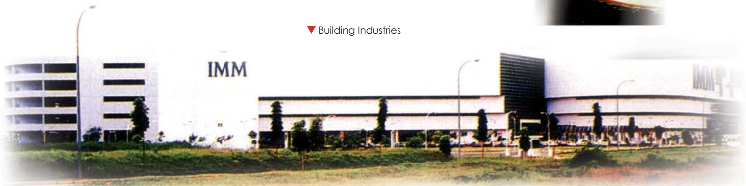
▼ Building Industries